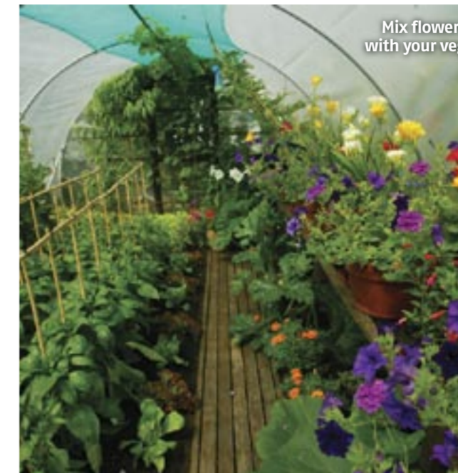
Mix flowers with your veg