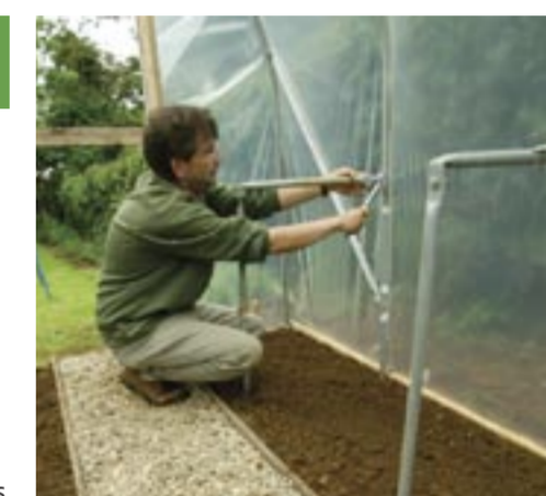
Adding staging supports gives you extra area for pots and containers