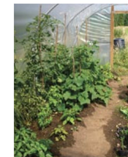
Without crop bars, you'll need sturdy canes to support tomatoes and cucumbers

'When the rain is pouring down, there are few better places to hide and do some digging'