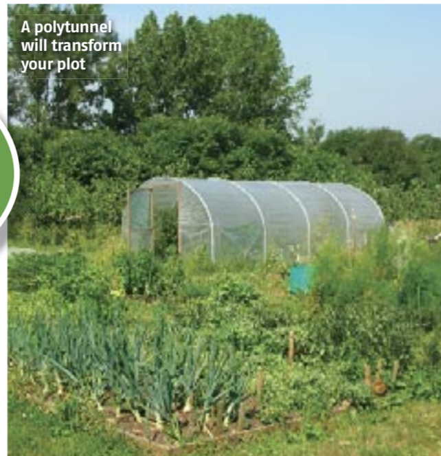
A polytunnel will transform your plot

GROW YOUR OWN VEG FINAL PART OF OUR SERIES