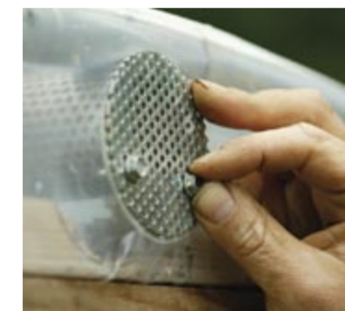
To improve ventilation, First Tunnels offer a ventilated ridge to circulate air

'When the rain is pouring down, there are few better places to hide and do some digging'