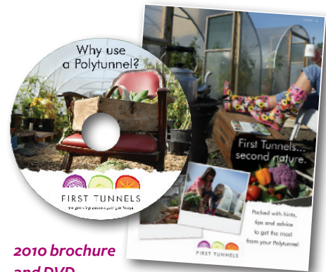
2010 brochure and DVD – order at FirstTunnels.co.uk

To find out more about how a polytunnel can save you money in these tough times – call First Tunnels today!