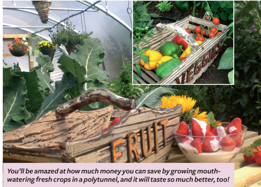
You'll be amazed at how much money you can save by growing mouth-watering fresh crops in a polytunnel, and it will taste so much better, too!

"Imagine saving over £1,000 every year!"