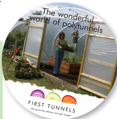
First Tunnels new DVD – out now!